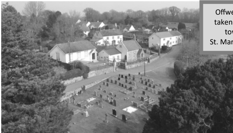
Offwell School taken from the tower of St. Mary's Church

The full report is available on our school website – www.offwell-primary.devon.sch.uk – so feel free to read that and also have a look at all the other things we do.